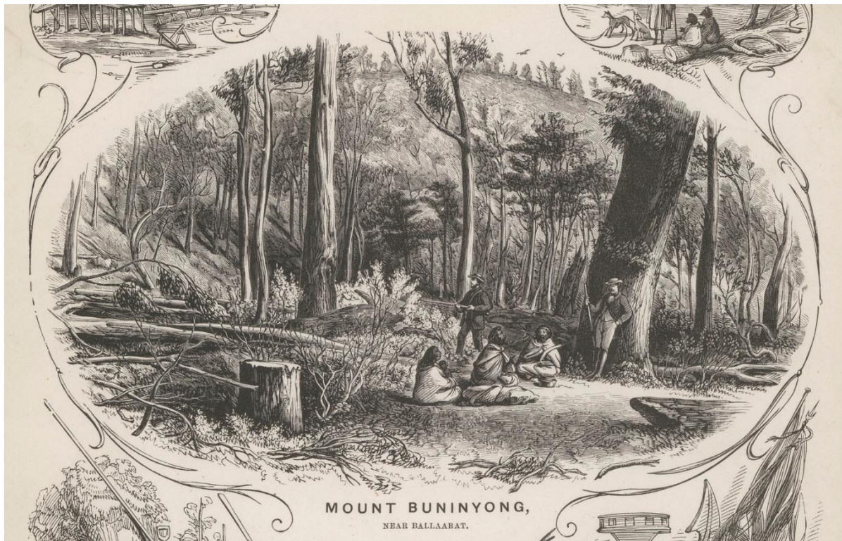
Figure 3.19 Detail from a sketch by Charles Frederick Somerton titled 'Mount Buninyong', published in the Illustrated Melbourne Post , April 1862.

Settlement and its ramifications also caused tension and conflict among Aboriginal people. William Thomas wrote of his impressions of a battle between the Barrabool and Buninyong clans of the Wadawurrung. 36