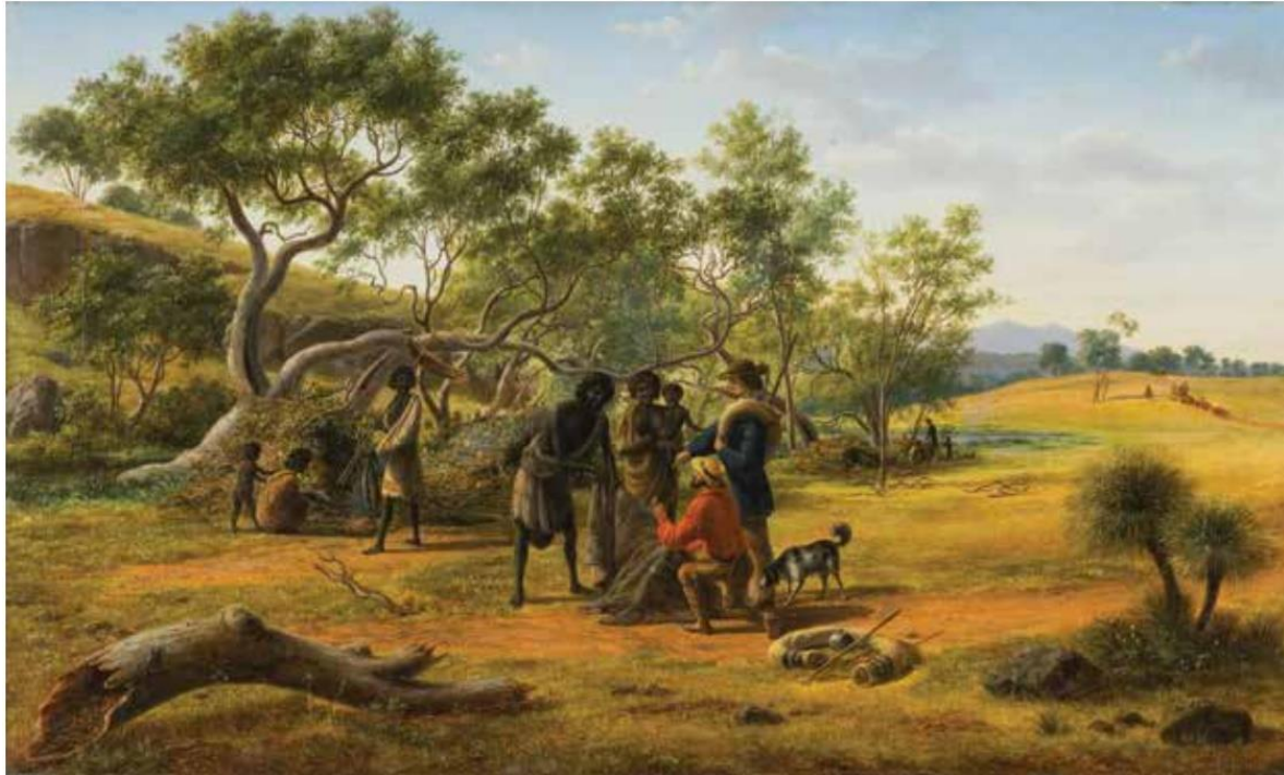
Figure 3.18 Eugene von Guérard, Aborigines met on the Road to the Diggings , 1854.