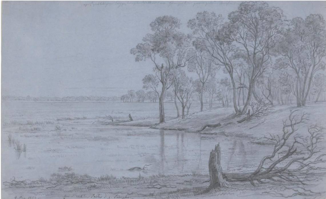
Figure 3.14 Sketch by Eugene von Guérard of the large lagoon that settlers named Black Swamp, and later Yuille’s Swamp, then Lake Wendouree, 1853.

A light tree cover was maintained by seasonal burning during the cooler months. The practice of burning stimulated the regrowth of vegetation, which not only managed the timber load and helped avert summer bushfires, but also benefited grazing animals such as kangaroos and wallabies by regenerating the grasslands. The Kulin built earthen ovens on the banks of creeks and rivers. They built fish traps at the edge of lakes and lagoons. The lagoons were rich in fish, eels, fresh-water crayfish and fresh-water mussels, as well as duck and swan eggs. Eels were prolific in Lake Burrumbeet. 15