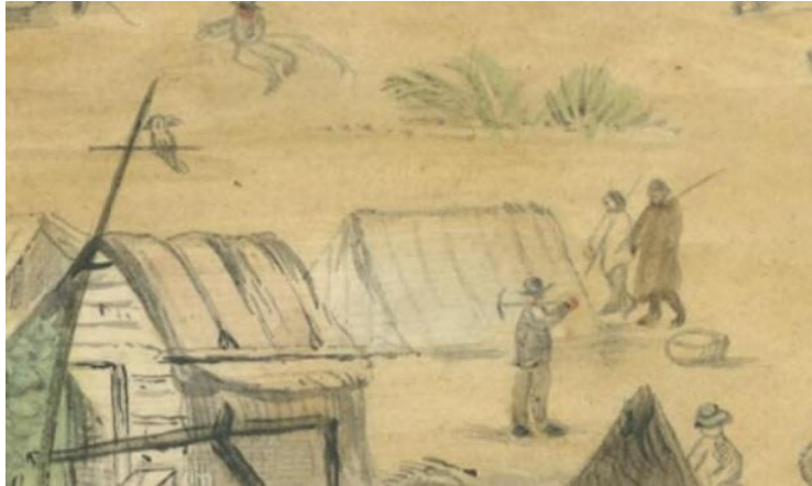
Figure 3.21 Detail from a sketch by David Tulloch of Golden Point, Ballarat, [1851?], showing two Aboriginal people walking through the camp.

claimed that some miners at Ballarat (c1850s-60s) found a stone tool 23 inches below the surface in ground that had not previously been disturbed. 45