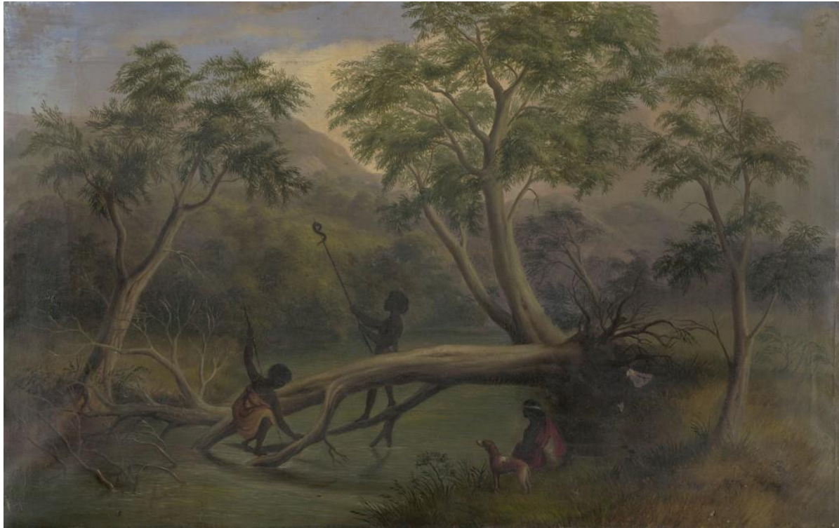
Figure 3.15 Spearing eels, Back Creek, c.1852.