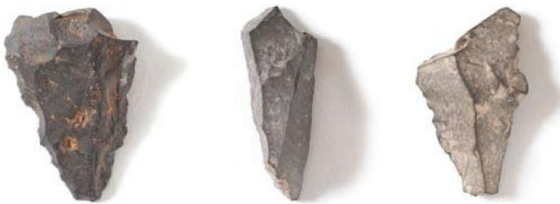
Figure 3.17 Spear tip fragments, Dja Dja Wurrung Clans Aboriginal Corporation.

Tools were fashioned from the available stone (FIGURE 3.17). Quartz was also used to make stone tools. 18 Wadawurrung and Dja Dja Wurrung peoples also obtained prized greenstone axe-heads through trade with the Wurundjeri Woi-wurrung people. Gold was known to the Kulin. The Dja Dja Wurrung people called it kara but did not regard it as particularly useful as it was too soft for tool-making. 19