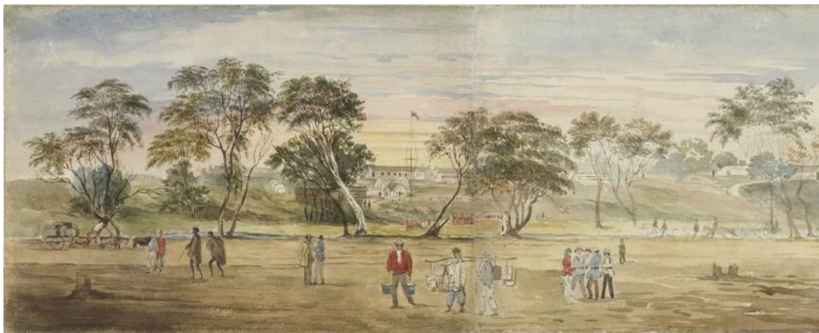
Figure 3.22 A view of Ballarat by S.T. Gill, 1854. Two Aboriginal people wearing possum-skin cloaks are depicted on the left.