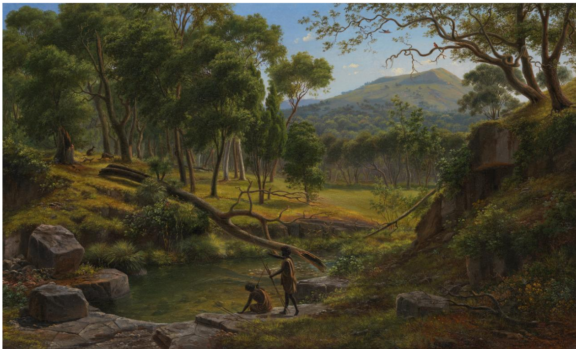
Figure 3.13 Eugene von Guérard, Warrenheip Hills near Ballarat , 1854.

Country provides vital resources for people through the wetlands, rivers and creeks that irrigate Country, and the wildlife and plants that can be utilised for food, medicine and other purposes. Prior to the disruption caused by colonisation, additional resources not provided by Country were obtained through extensive trade routes that extended across the territory of the five tribes of the Kulin Nation, and beyond.