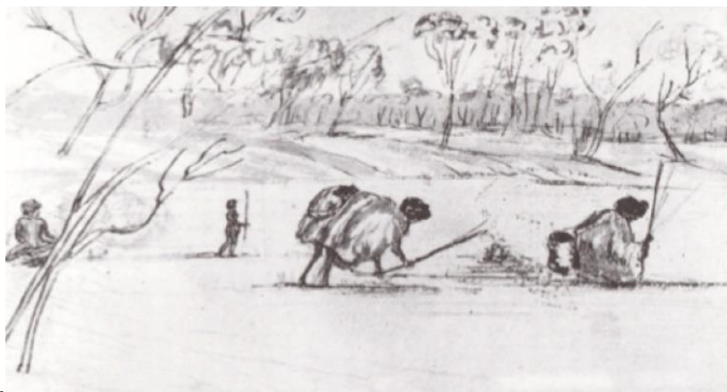
Figure 3.16 Wadawurrung women digging for root vegetables, from a sketch by John Helder Wedge, titled 'Native women getting Tam bourn roots, 27 August 1835'. (Source: Wedge papers, Manuscript Collection, State Library Victoria)

Trees were valuable resources. They provided shade and shelter and they were also meeting places and birthing places. Large hollow trees were used to smoke eels. The bark of large eucalypts was used to make shelters, canoes, and coolamons. Protruding knots in the bark were made into water containers. The limbs of trees were used to make tools and other weapons. Large trees were scaled to procure possums, which were caught for food and also for their skins, which were sewn into cloaks and rugs.