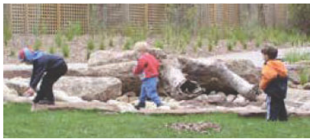
nature play elements

Nature play provides a space with elements like timber logs or large rocks. They offer opportunities for social, imaginative and cognitive play to occur.